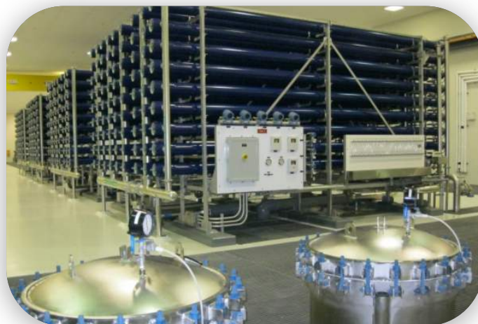
Reverse Osmosis Plant Chemicals